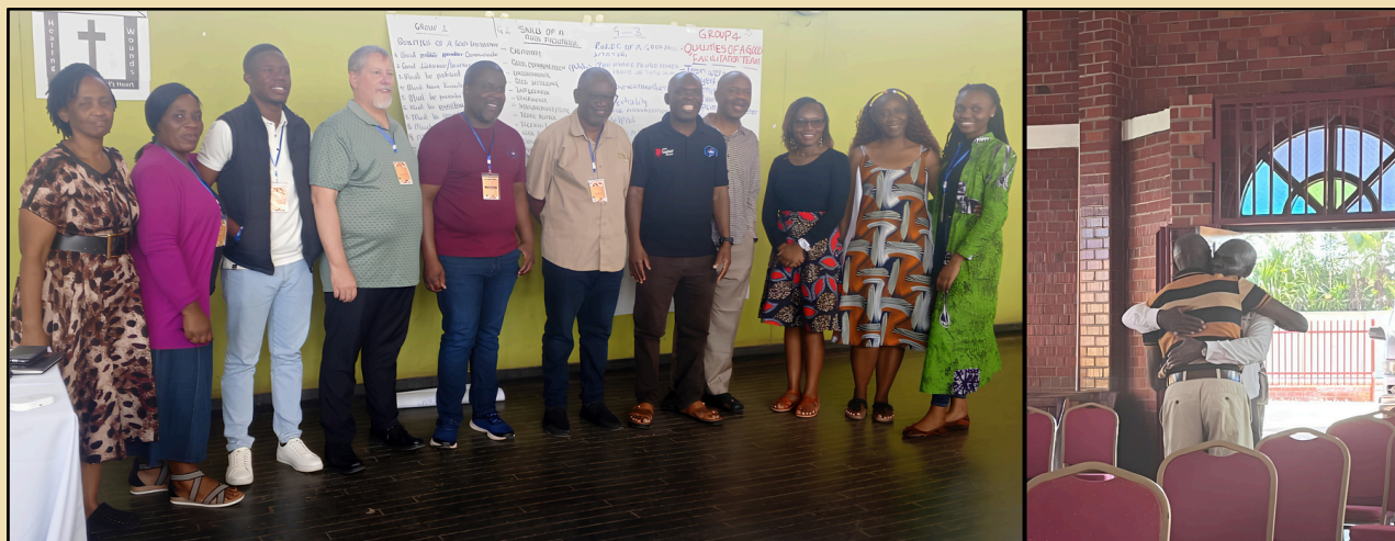
HHTN and TEEZ facilitators pose for a photo

The team also discussed new ways of sharing HHTN principles through sermons, conferences, creative arts, and community initiatives.